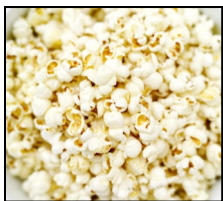
Popcorn is a good snack choice for lunchboxes as long as you hold the butter and the salt!

Choose foods from the four food groups of Canada's Food Guide to help you meet your daily needs.