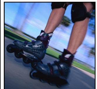
Looking for a new activity to try as a family? How about inline skating?