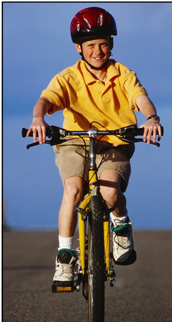
Kids between the ages of five and 14 account for half of the cycling-related deaths in Canada each year.

Helmets are the safe way to go when cycling ... and they're also the law