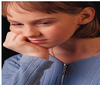
One in five children will face a mental health challenge at some point in their childhood or adolescence.

For more information about World Mental Health Day, visit the World Federation for Mental Health's