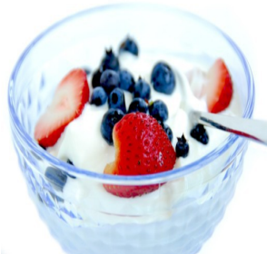
Yogurt topped with fresh fruit is a great party snack.

For more information and celebration snack ideas please visit www.albertahealthservices.ca