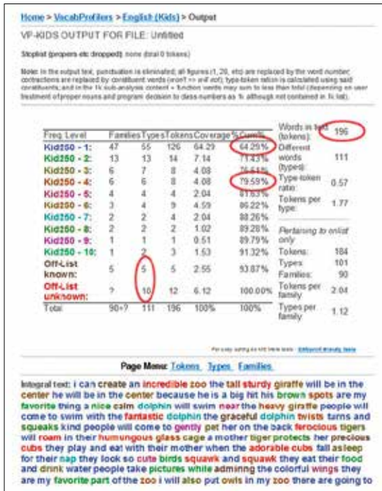
Fig. 4: Vocabulary profile of sample of excellent writing

VP profile is “rainbow-like,” reflecting a lexical richness throughout: sturdy, roam, nap, calm, ferocious, precious, adorable. This writer does not over-depend on the high frequency (blue-coded words): doing so would have resulted in an “ocean” effect of predominantly blue-coded words. At Band 1, some 64.20% of the words have been used. At Band 4, 79.59% coverage is realized. The control over mid- to low-range vocabulary, words that might be described as Tier 2 words (Beck, McKeown, & Kucan, 2002), is noteworthy: “adorable” is more nuanced and precise than “cute” and “small”; “roam” versus “walk.” This youngster has used 15 words that stretch beyond the oral vocabulary repertoire of childhood—the “off-list known and unknown” words, and is beginning to extend productive vocabulary by way of words that represent more academic-like choices. This reflects a very strong profile (see Roessingh, 2012b). At 196 words in length, the writing is elaborated, developed, and very long for only a Grade 2 student at the end of the year!